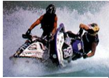
Noise, fumes... and danger

The increasing use of jet skis on the metropolitan coastline is damaging the quality of life, health and safety for everyone spending time on or near our beaches. The noise, fumes and pollution from just one of these vehicles can mar the peaceful enjoyment of hundreds of beach goers. Even more alarmingly, many of the users flout marine safety and council regulations by speeding near swimmers, canoists, jettys and the beach, and by landing and leaving from our beaches.